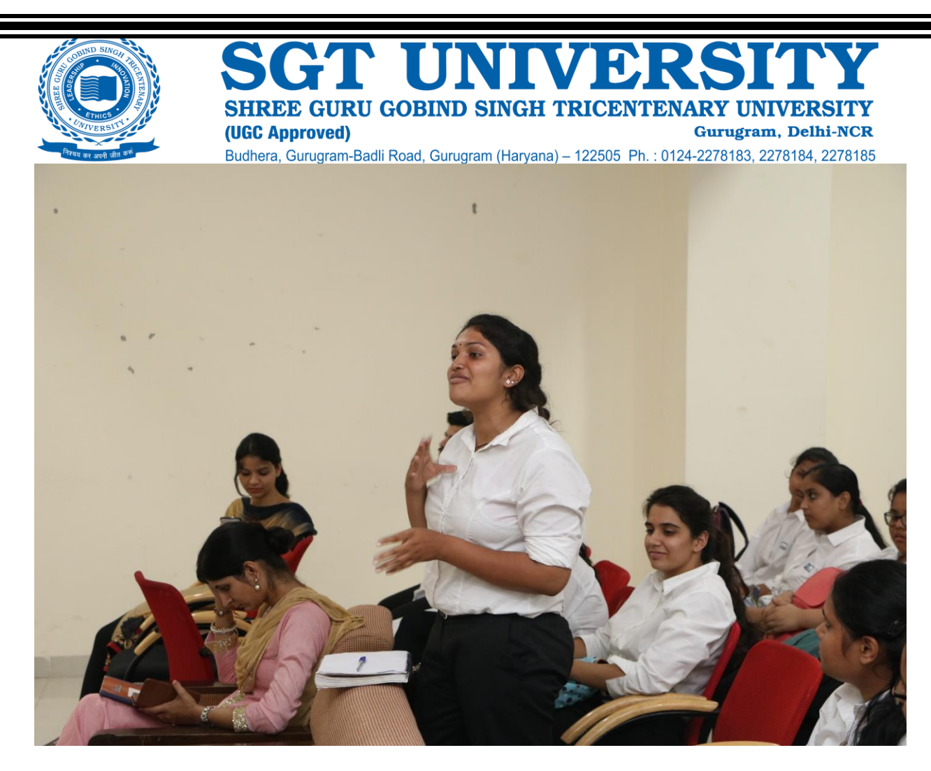
Figure 01 A student is asking a question