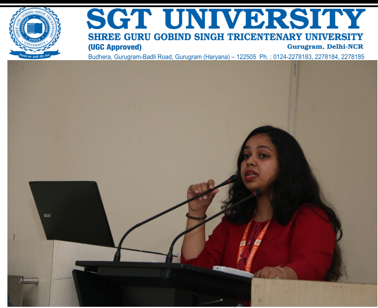
Figure:02 Workshop in progress