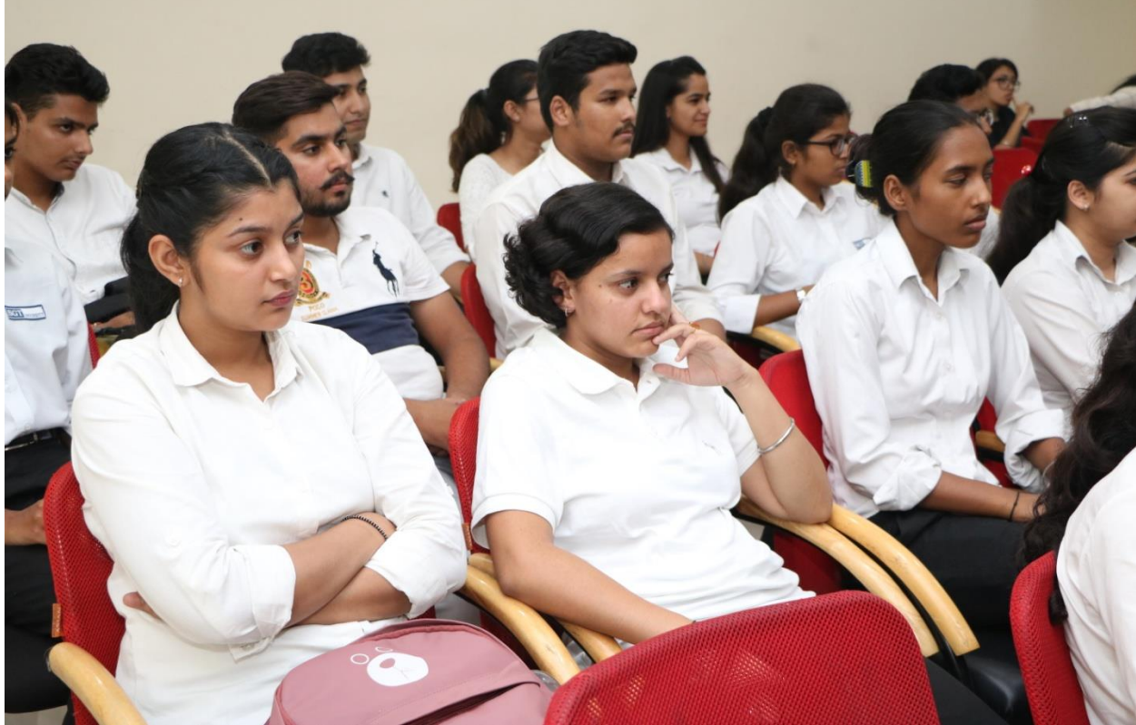
Figure:03 Audience at the Workshop

(UGC Approved) Gurugram, Delhi-NCR Budhera, Gurugram-Badli Road, Gurugram (Haryana) – 122505 Ph.: 0124-2278183, 2278184, 2278185